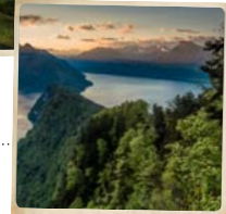
Ennetbürgen, Bürgenstock panorama, Lucerne-Lake Lucerne Region