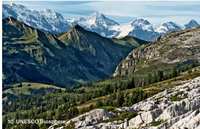
10 UNESCO Biosphere