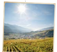
Wine area Salgesch, Valais