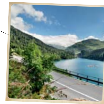
Marmorera reservoir, Graubünden