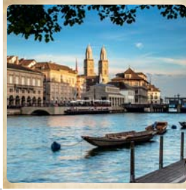
Banks of the Limmat River, Zurich