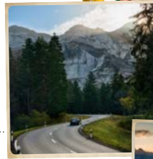
Schwägalp, Eastern Switzerland / Liechtenstein