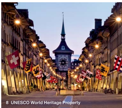
8 UNESCO World Heritage Property